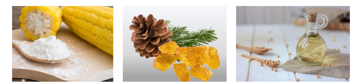
Figure 1. Typical biomass feedstock Left: Starch, Center: Rosin, Right: Soybean oil

Figure 1 shows examples of typical plant-derived biomass feedstocks. Plant-derived biomass feedstocks can be roughly classified into hydrophilic and hydrophobic materials. Plant-derived biomass feedstocks classified into hydrophilic substances are starch and cellulose, and its hydroxyl group modified derivatives. Oxidated and aminated starches are used as chemicals to improve the strength of paper.