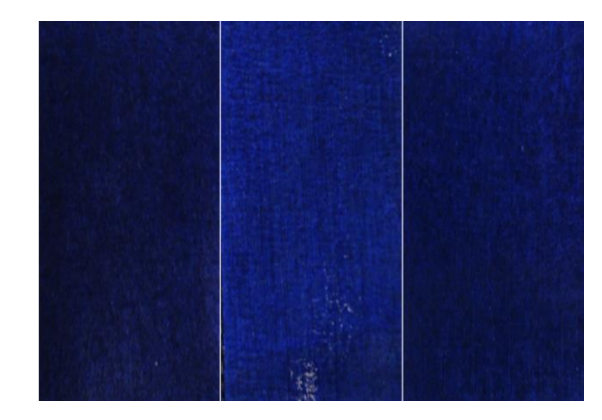
Figure 3: Photographs of the coating film during inking (left: Emulsion B, middle: Emulsion B / Rosin mixture, right: PE-2189)

The slight increase in gloss is observed by simply mixing emulsion B and rosin varnish compared to the use only Emulsion B and meanwhile, the styrene-acrylic / modified rosin hybridized emulsion, PE-2189 shows a significant improvement of gloss. PE-2189 shows excellent color development of printing as well as Emulsion B. Whereas, the mixture of Emulsion B and modified rosin gives lower print density. These results suggest that hybridizing styrene acrylic resin with modified rosin is the key factor to improve performance